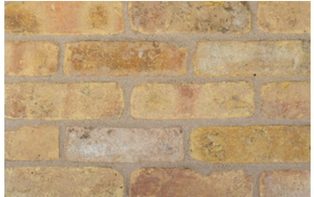
Aldwych Yellow Rustica